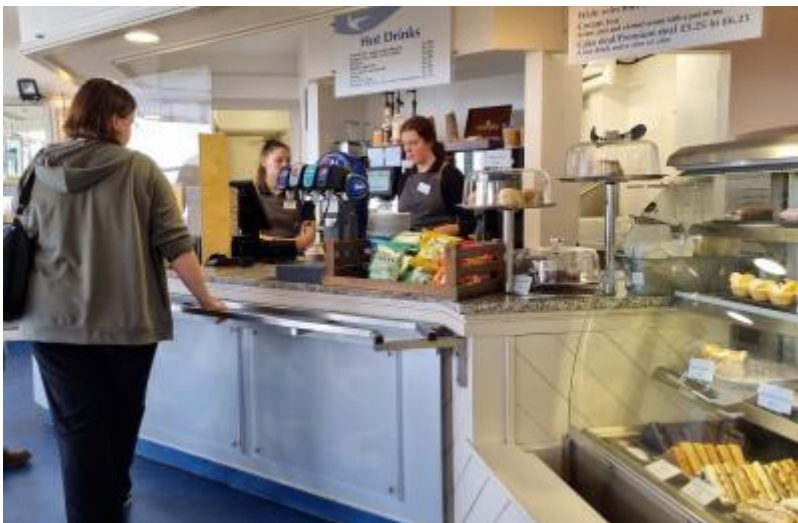
Photo shows the counter of the cafe, with a glass cabinet with various food items, a self serve drink machine and a tray rail.