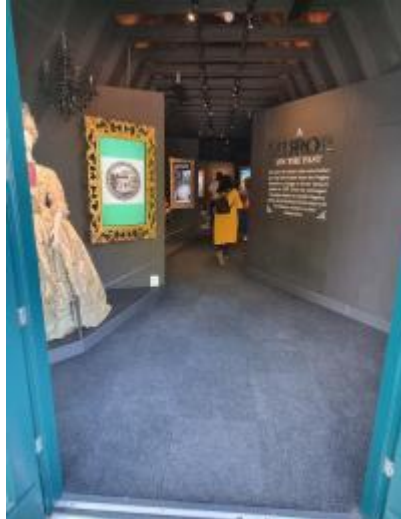
Photo shows the entrance to the exhibition, with a wide doorway. In the photo is a past exhibition which is now closed, the doorway remains the same.