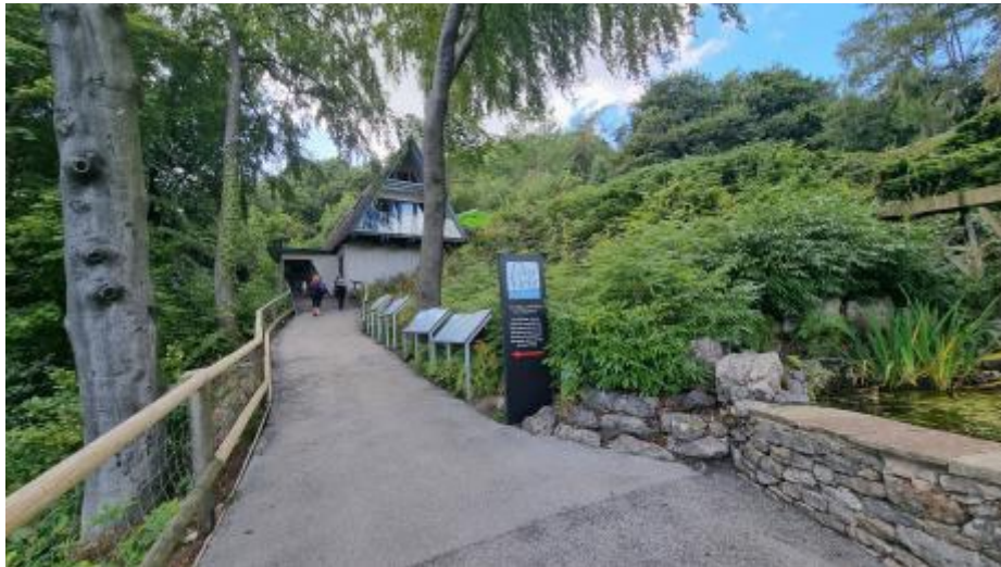
Photo shows the slight slope of the route to the Long View building, with the white and green building in the background.

There is also a gift shop here selling rock-themed souvenirs. This is accessed the same way that you access the film theatre.