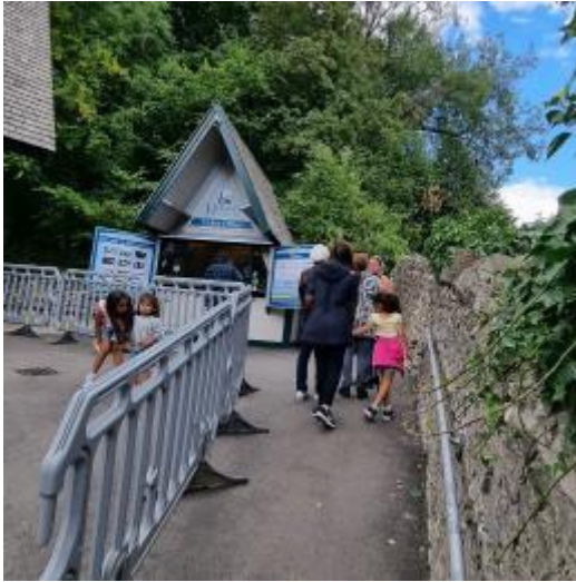
Photo shows the ticket office- a small building with a triangle shaped roof. There is a grey barrier to split the footpath.