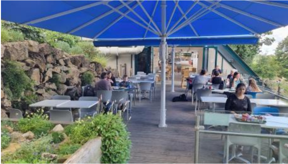
Photo shows the outdoor terrace, with a blue parasol providing shade. There are 12 tables.