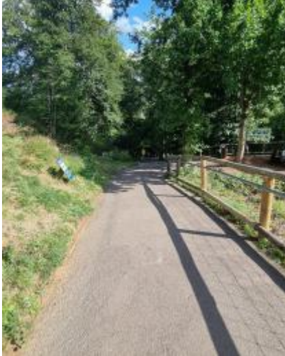
Image shows the steep pathway down to the Tavern and Rutland Cavern.