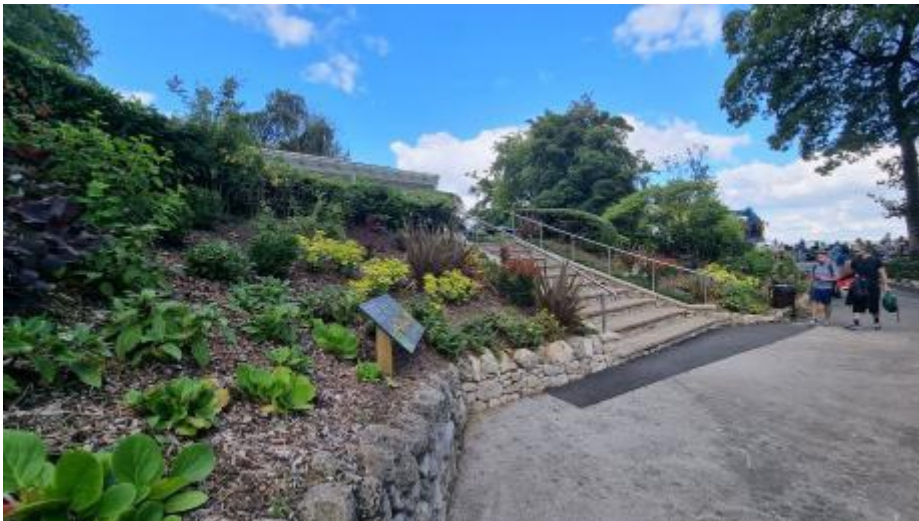
Photo shows the Alpine Garden, located on a slope, with level access to the right and steps in the middle.