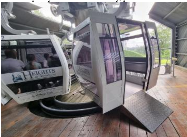
Image shows the cable car in stationary position, with the doors open and a temporary ramp in place.

If you are not a wheelchair or mobility scooter user, but feel you need the cable car to stop so you can board safely, please let a steward know.