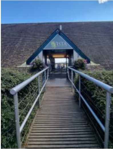
Photo shows the entrance to the Vista, along a wooden pathway with handrails either side.