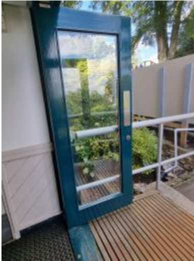
Photo shows a glass door with a contrast dark green frame.