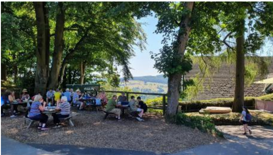
Photo shows picnic benches in use, in a designated area.