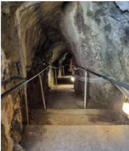
Photo shows the steps underground, and the uneven surface of the floor in the cavern. There is a handrail.