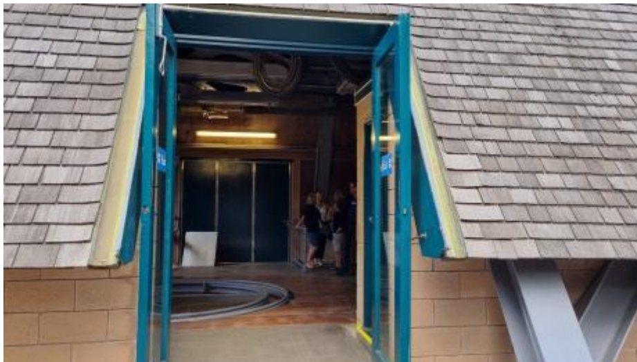
Image shows the alternative wider door that can be used if needed, not the main entrance.