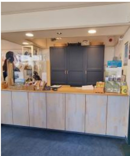
Photo shows the gift shop information desk. A light blue paneled low desk.