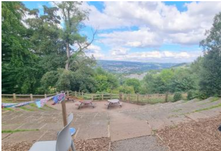
Photo shows the view from the amphitheatre, of cliffs, woodlands and a town. There are some steps and benches.