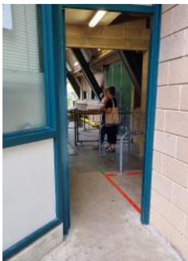
Image shows the main entrance door, which is always left open. The door is surrounded by a dark green frame.