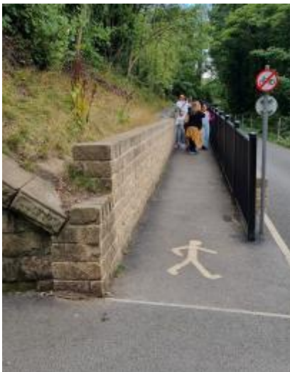
Photo shows the pedestrian route to the Heights, with a railing on the right to separate from the access road.