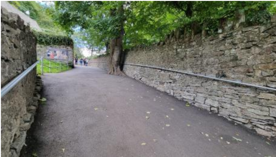
Photo shows the steep pathway leading to the main entrance. There is a handrail to the right.