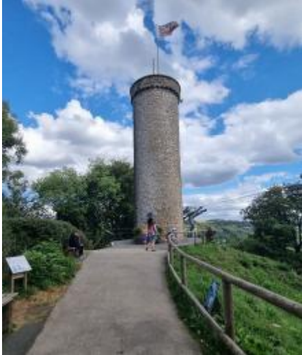
Photo shows the Victoria Prospect Tower, a grey vertical tower made from stone with a Union Jack flying from the top.