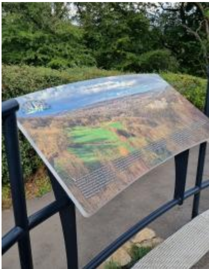
Photo shows one of the information panels, depicting the scenic view from the top of the tower.