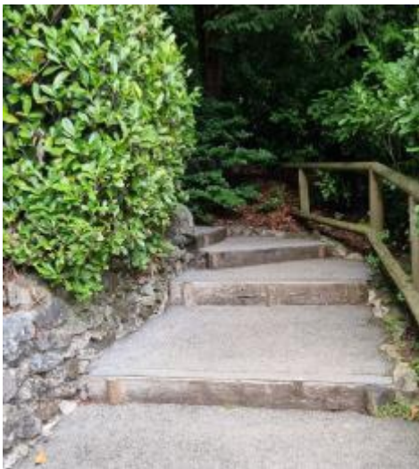
Photo shows some of the steps to the Tavern and Rutland Cavern.