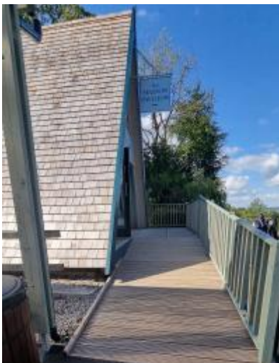
Photo shows a small permanent wooden ramp to the exhibition building.

This exhibition is a walk-through showing the story of The Wombles and some art inspired by The Wombles. You access the entrance by a ramp and head through the door. The corridor in the middle of the exhibition is 1000mm wide, and is a slight zig zag. There are video displays explaining each section.