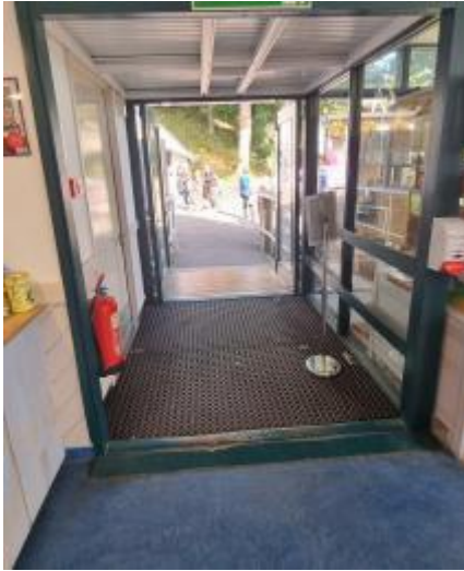
Photo shows the gift shop door, a wide double door with a contrast green frame.