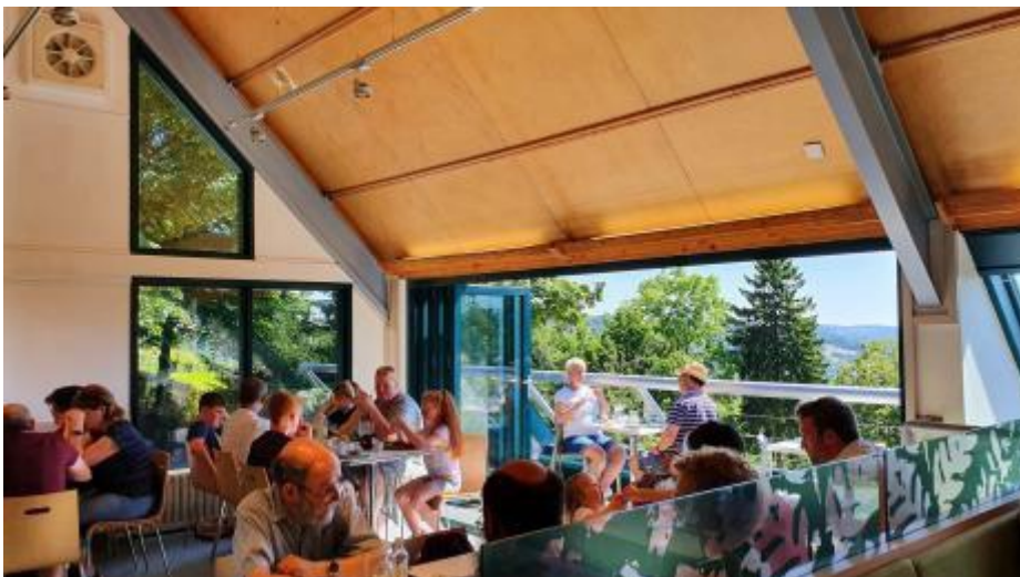
Photo shows the inside of the Vista restaurant, with tables full, floor to ceiling doors that are open and a scenic view.