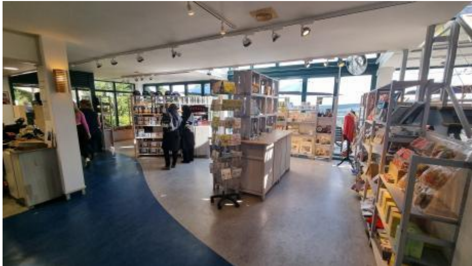
Photo shows the layout of the gift shop, with an island in the middle and shelves around the edge.