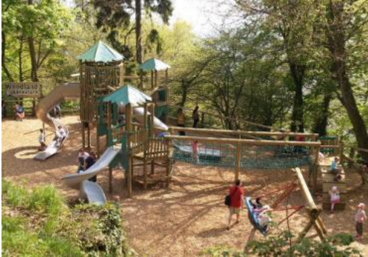
Photo shows the Woodland Adventure playground, with slides, climbing frames and swings.