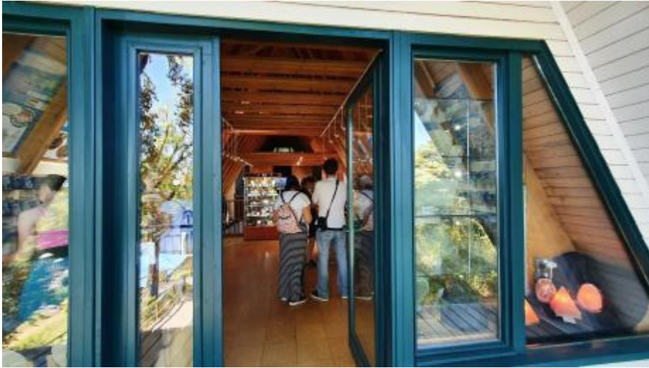
Photo gives a look into the Rockshop, with salt lamps, space inside, and a jewellery cabinet in the background.