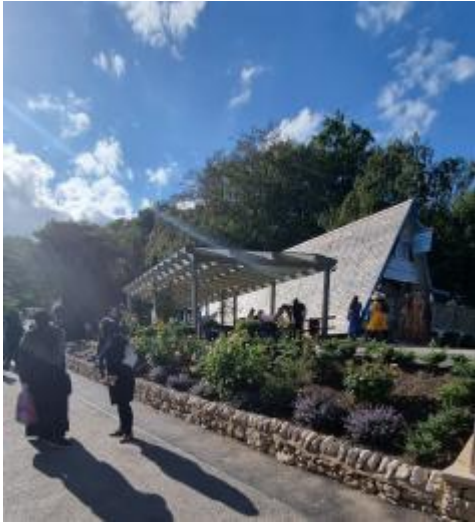
Photo shows the small rose garden on the right with a small walled border. This is on a slope.