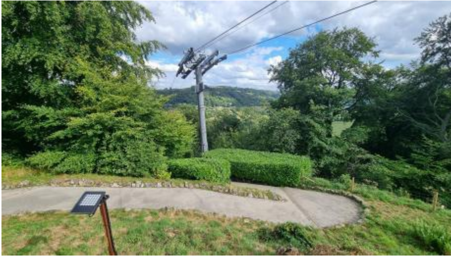
Photo shows a zig-zag pathway with a steep gradient. There is now a handrail here too.