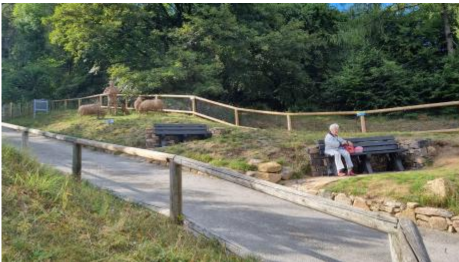
Photo shows one of the pathways, with a steep gradient, with benches placed alongside.