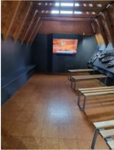
Photo shows the inside of the film theatre, with benches on the right and space on the left. Screen in the centre.